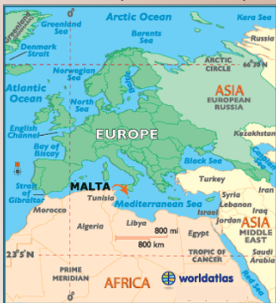
Malta is strategically located between Africa, Europe, Asia, and the Middle East