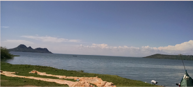
Fishing nets on the shores of Lake Victoria

Scenic Lake Victoria is the location of our second CCI church plant which is called Jehovah Jireh Church. This is where we also have our second Saturday Child Development Program. Our church is in a small fishing village on Rusinga Island which is very close to the town of Mbita.