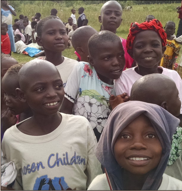
Children of Bungoma, Kenya

The Bible teaches us that God considers instructing the next generation in His ways a top priority: